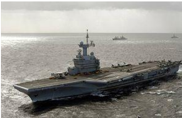
France will share aircraft carrier Charles de Gaulle with British Royal Navy.

Britain and France struck a historic defense deal recently, aimed at preserving military muscle in an age of austerity, pledging to deploy troops under a single command, share aircraft carriers and collaborate on nuclear programs that were once fiercely guarded. The often skeptical neighbors insist an era of unprecedented cooperation is a pragmatic fit for two cash-strapped allies.